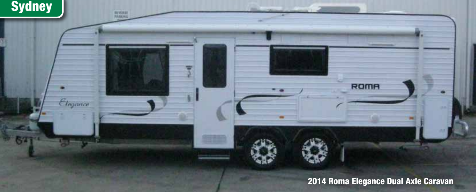
2014 Roma Elegance Dual Axle Caravan